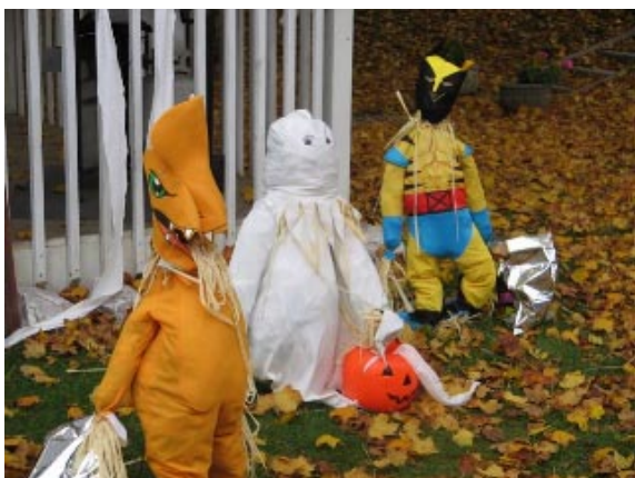
TRICK OR TREAT