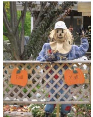
ORDINARY JOE CROW