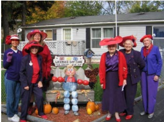
SECOND PLACE - ABC123 DAYCARE and the Real Elegant Dame Judges