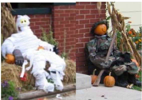
HAROLD THE MUMMY & ARMY JOE CROW