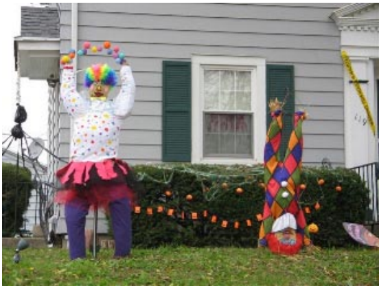
FIRST PLACE - ARBUCKLE FAMILY