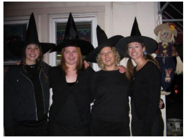
THE GOOD WITCHES OF BOLINGER'S