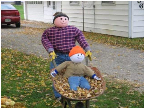
THIRD PLACE - FATHER & SON