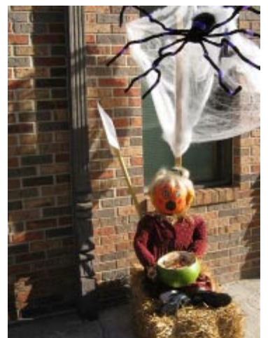
LITTLE MISS MUFFET