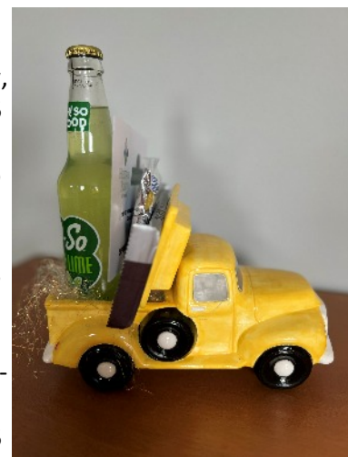
Photo Above: Ceramic Truck by Heritage Pointe of Warren Ceramic Shop (hand painted by a Heritage Pointe Community Member).