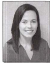
Warren Family Dentistry 470 Bennett Dr. Suite C - Warren • 375-2246