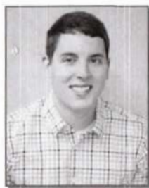
Warren Dental Clinic 470 Bennett Dr. Suite A - Warren • 375-2626

In 1980 Decatur Dental Services was founded, and over the past 35 years has grown to include 5 satellite locations; Geneva Dental Clinic, Bluffton Dental Clinic, Berne Dental Clinic and our new locations, Warren Dental Clinic and Warren Family Dentistry. We offer a wide range of dental services, including preventative, cosmetic, restorative, and orthodontic treatments.