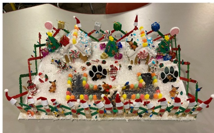
1 ST PLACE GINGERBREAD HOUSE - YOUTH ORG. SMALL WORLD PRESCHOOL