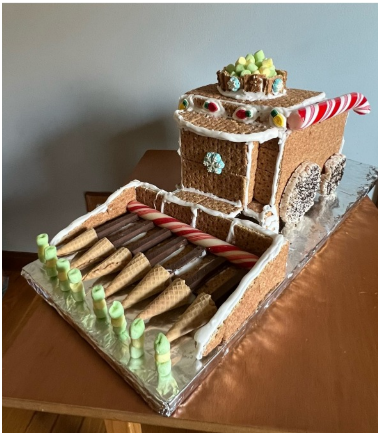
1 ST PLACE GINGERBREAD HOUSE - IND. YOUTH MERRITT SOUDER