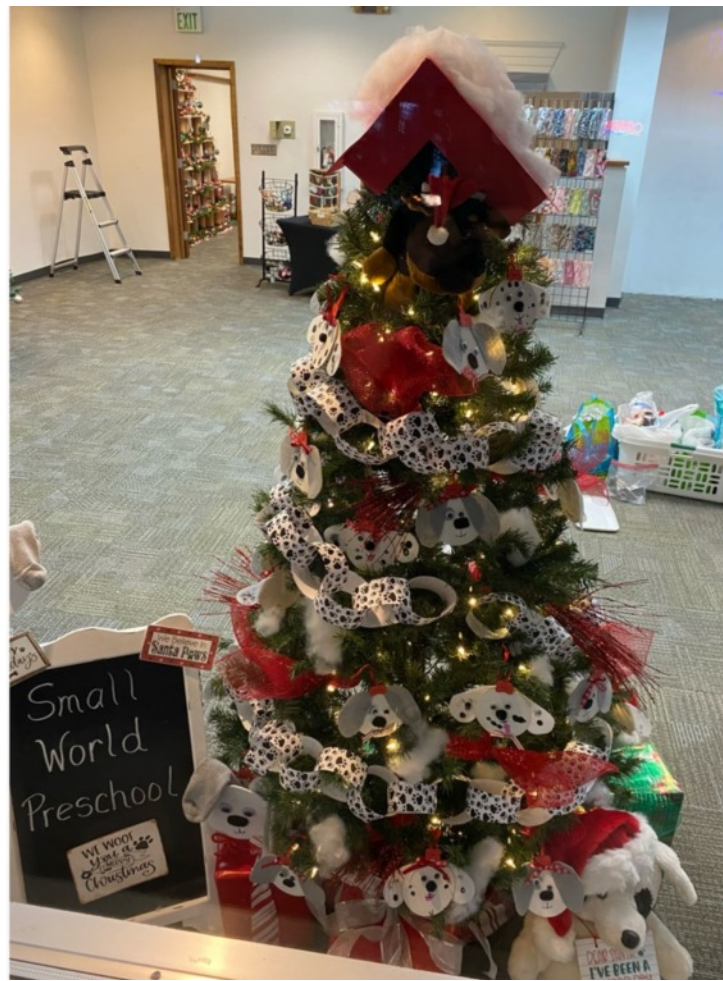
1 ST PLACE FESTIVAL OF TREES - YOUTH ORGANIZATION SMALL WORLD PRESCHOOL