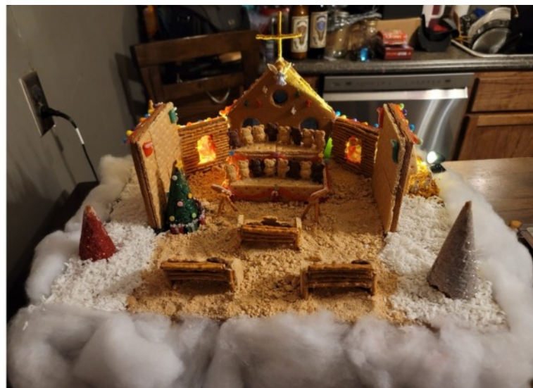
1 ST PLACE GINGERBREAD HOUSE - INDIVIDUAL ADULT LASHAMY FAMILY