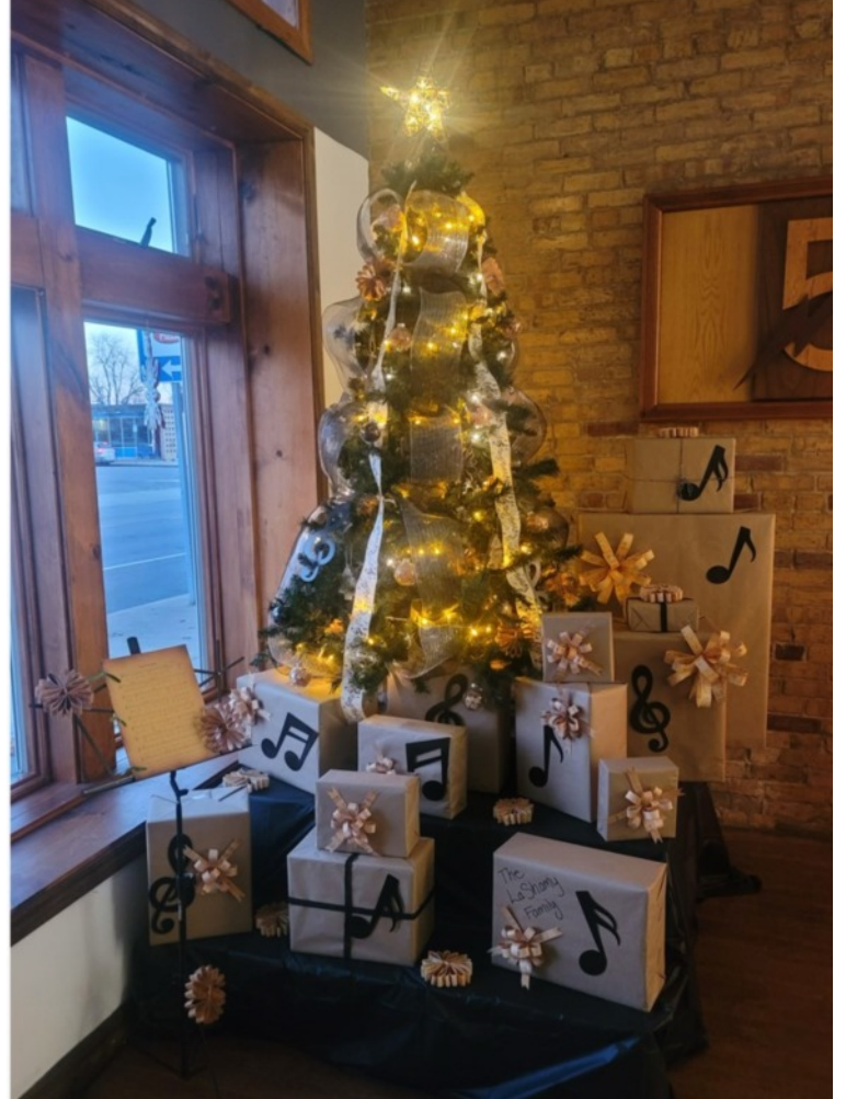
1 ST PLACE FESTIVAL OF TREES - INDIVIDUAL/FAMILY LASHAMY FAMILY