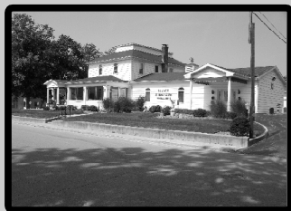
H BROWN & SON • Warren 260-375-3110