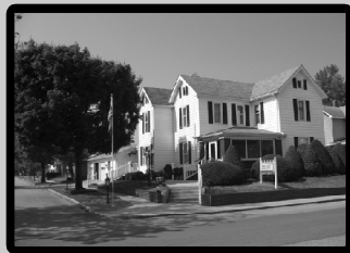
FERGUSON & GLANCY • Van Buren 765-934-2211