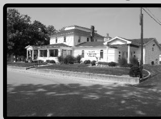
H BROWN & SON • Warren 260-375-3110