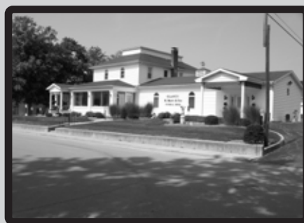
H BROWN & SON • Warren