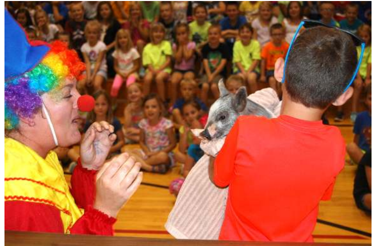
KISSING THE PIG . . .