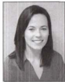
Warren Family Dentistry 470 Bennett Dr. Suite C • Warren • 375-2246

Decatur Dental Services... Wishing Everyone a Lifetime of Healthy Smiles!