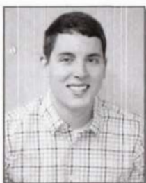
Warren Dental Clinic 470 Bennett Dr. Suite A • Warren • 375-2626

In 1980 Decatur Dental Services was founded, and over the past 35 years has grown to include 5 satellite locations; Geneva Dental Clinic, Bluffton Dental Clinic, Berne Dental Clinic and our new locations, Warren Dental Clinic and Warren Family Dentistry. We offer a wide range of dental services, including preventative, cosmetic, restorative, and orthodontic treatments.