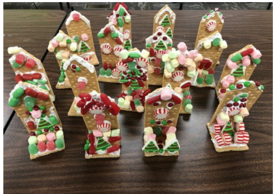
1ST PLACE in the Gingerbread House YOUTH ORGANIZATION went to Solid Rock United Methodist Church Kids Club.